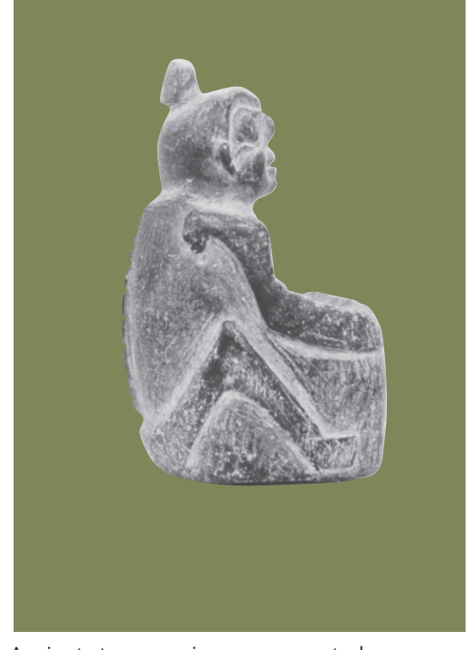
Ancient stone carvings were created many centuries ago.

All First Nations cultures have organized governments with different governing systems, some hereditary and some appointed. In these systems, a leader is recognized for his or her ability to take care of the people through the stewardship of the land and its resources. The sharing of accumulated wealth raises the esteem of a leader and his or her group. Every First Nations culture has a word that describes its own laws, and these words are generally complex, encompassing more than one concept. In Nisga'a, for example, the word is Ayuuk, and it refers to the system of justice that people must follow from birth to death. Within these legal dictates there is a constant goal of balance and harmony within the community. This is governance.