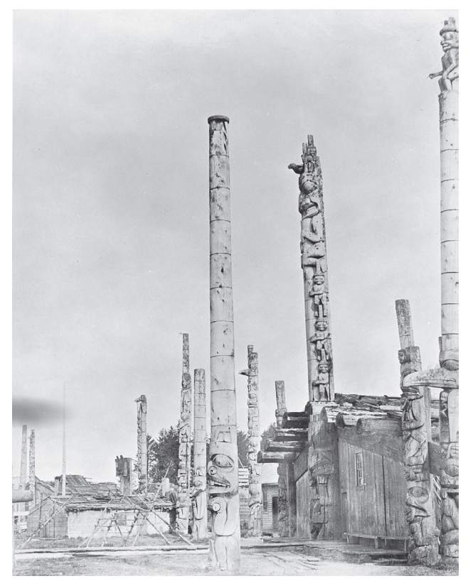
Haida poles proclaim the importance of family histories.

There are many significant pieces to oral traditions. While there is sometimes room for innovation and creativity, it is important that the people trained to carry the stories retell them accurately, in order to