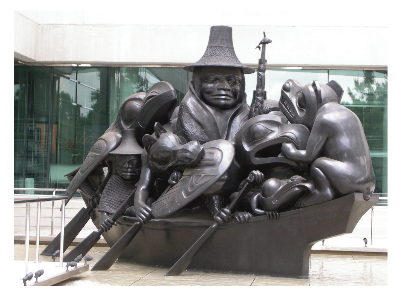
"The Spirit of Haida Gwaii" by Bill Reid. Image in the public domain

The monumental bronze sculpture of a canoe carrying 13 figures, called The Spirit of Haida Gwaii, is another symbol of northwest coast culture created by Bill Reid. The sculpture, cast in 1991, is now housed in the lobby of the Canadian Embassy in Washington, D.C., U.S.A. The sculpture weighs almost 5000 kilograms and is considered Bill Reid's master work. The Embassy's architect had invited Bill Reid to create a dynamic piece of art to balance the building's classic style.